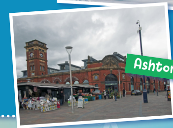
Ashton Under Lyne