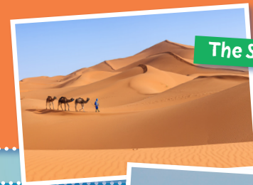
The Sahara Desert

Few people live in the North and South Pole because it is very cold.