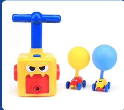
This toy pumps balloons to power the toys cars.