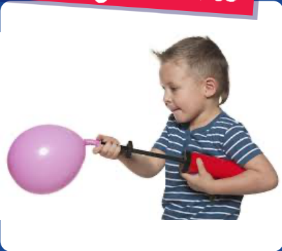
This boy is pumping up a balloon with a hand pump.